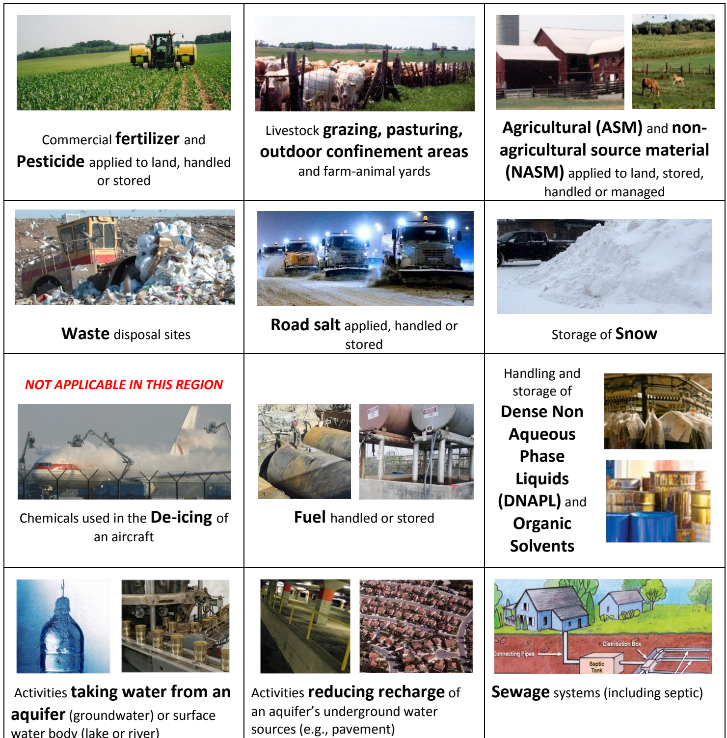
Table 2: The 21 prescribed drinking water threat activities covered by the Clean Water Act, 2006 grouped into 12 categories.

The Ministry of the Environment and Climate Change prescribed 21 drinking water threat activities listed in Table 2 that are covered by the Clean Water Act, 2006 which apply to 1 of the 3 categories listed in Table 1 .