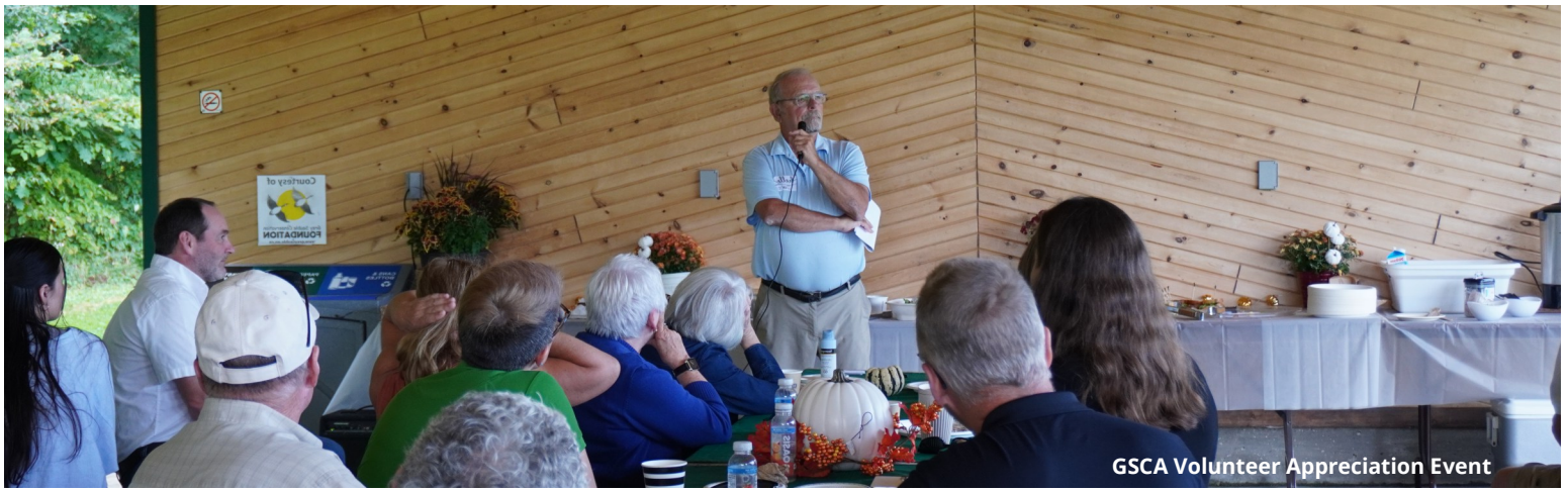
GSCA Volunteer Appreciation Event