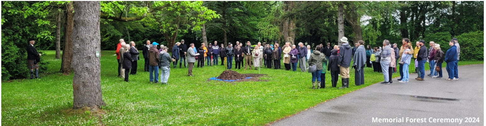
Memorial Forest Ceremony 2024

The Grey Sauble Conservation Foundation (GSCF) was established in 1993 and is a federally registered, charitable, not-for-profit organization that raises money to assist the Grey Sauble Conservation Authority (GSCA) fund programs and projects. The Foundation offers opportunities for the public to actively participate in conserving and enhancing the natural heritage that exists within the GSCA watershed.